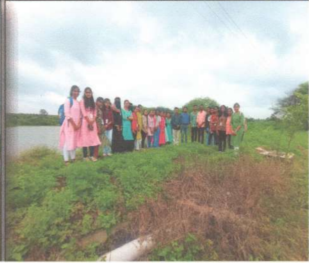
Field Visit at Fish Seedling Centre, Koradi, Gov. of Maharashtra